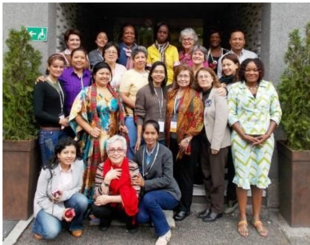
Participants from 56th 'From Global to Local'

"From Global to Local" is a programme designed to fill the gap between human rights monitoring by the CEDAW Committee at the inter-national level, and grassroots activism of NGOs de-manding government accountability at the national level.